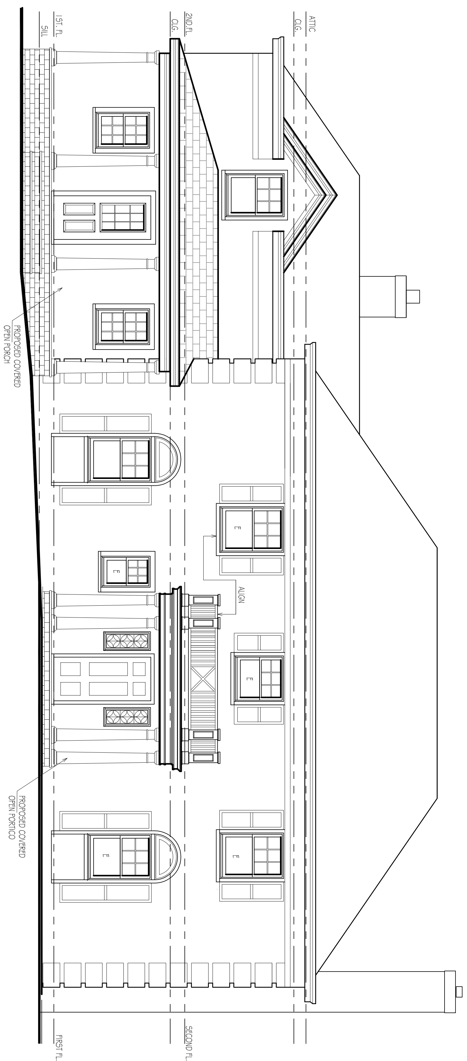
1 FRONT ELEVATION SCALE: 1/4" = 1'-0"