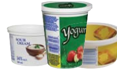
Plastic Dairy Tubs/Lids