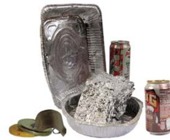
Metal Cans, Aluminum Foil, Small Metal Food Trays, Metal Lids (over 2")