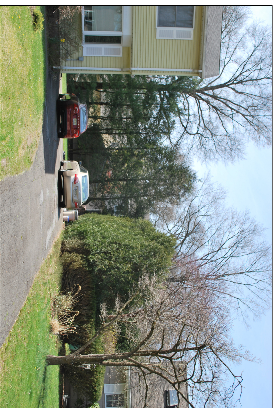
2 DRIVEWAY - EXISTING BUFFERING EVERGREEN LINE SCALE: NIS