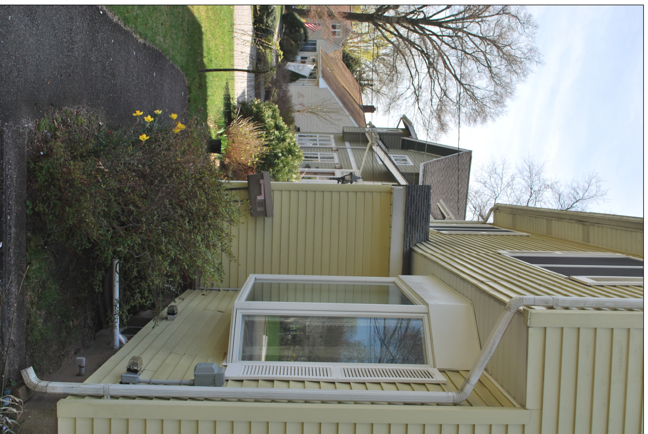
3 FRONT SETBACK VIEW FACING EAST SCALE: NIS