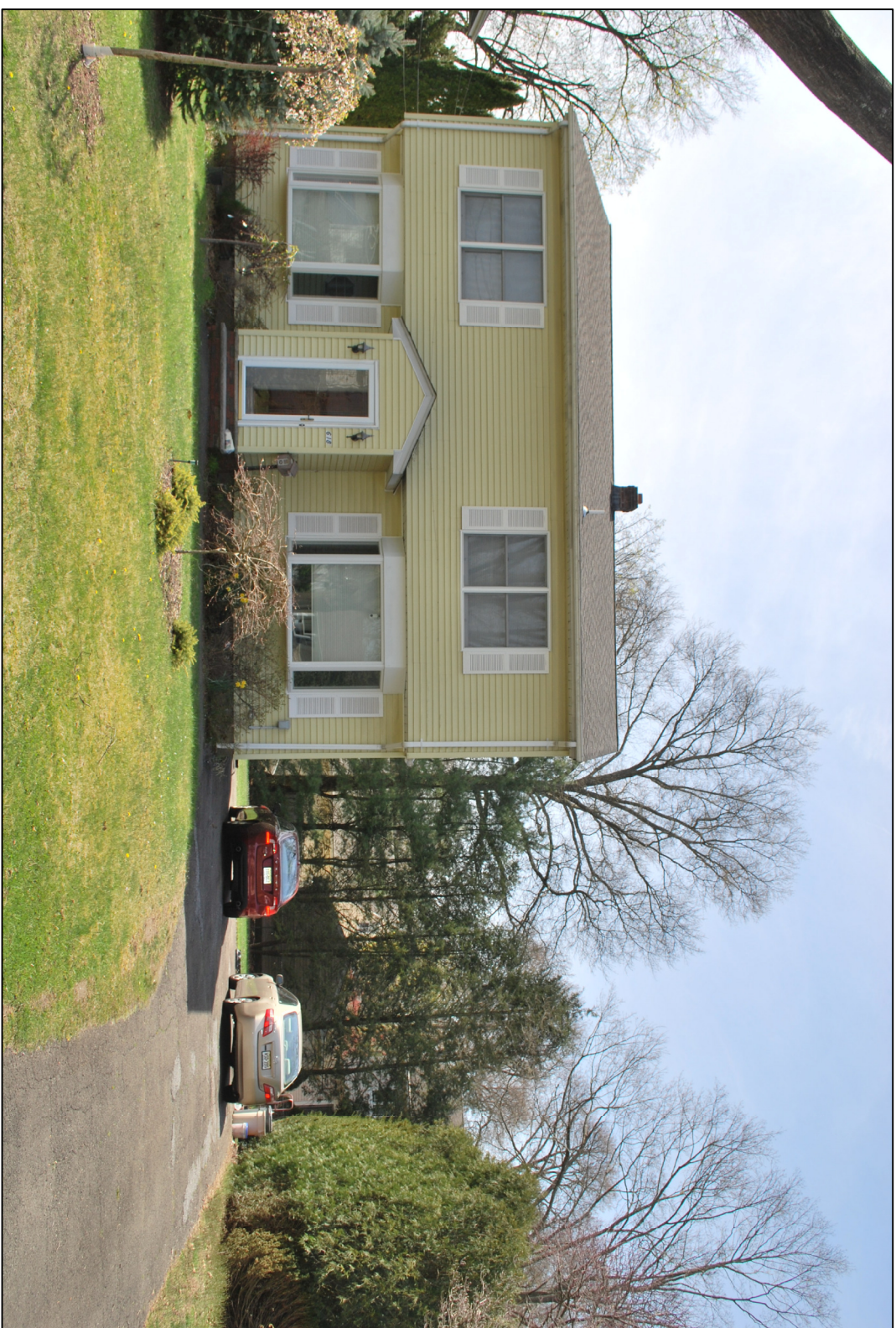
1 FRONT HOUSE SCALE: NIS