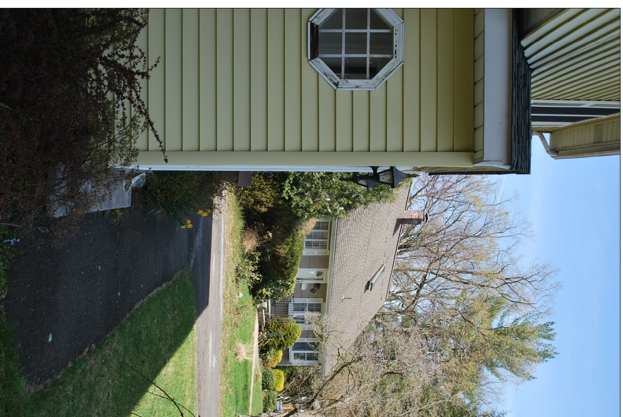
4 FRONT SETBACK VIEW FACING WEST SCALE: NIS