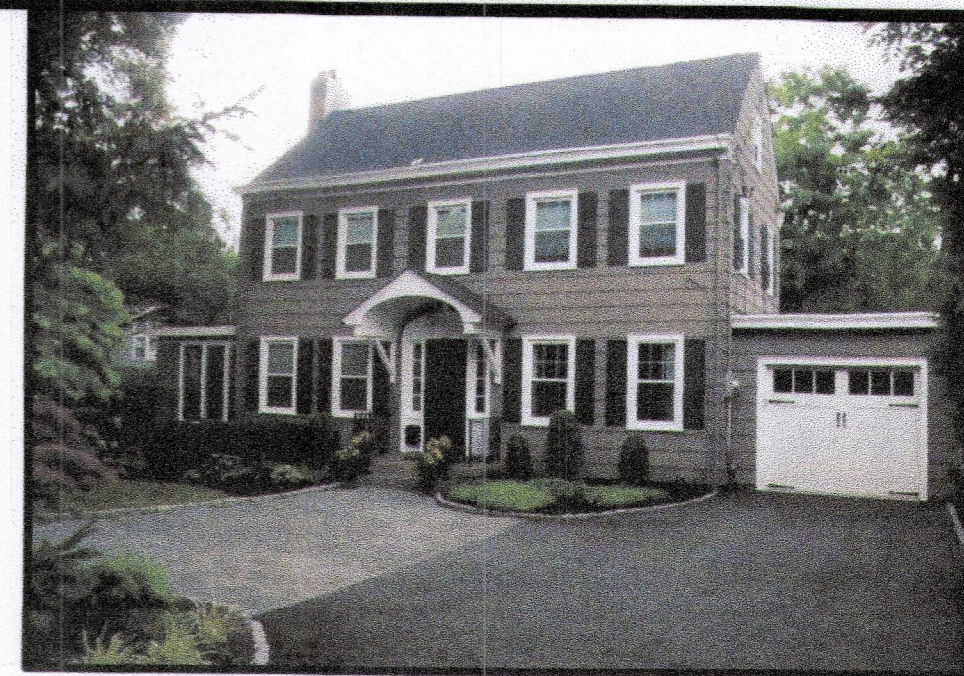
FRONT VIEW FROM GODWIN AVENUE