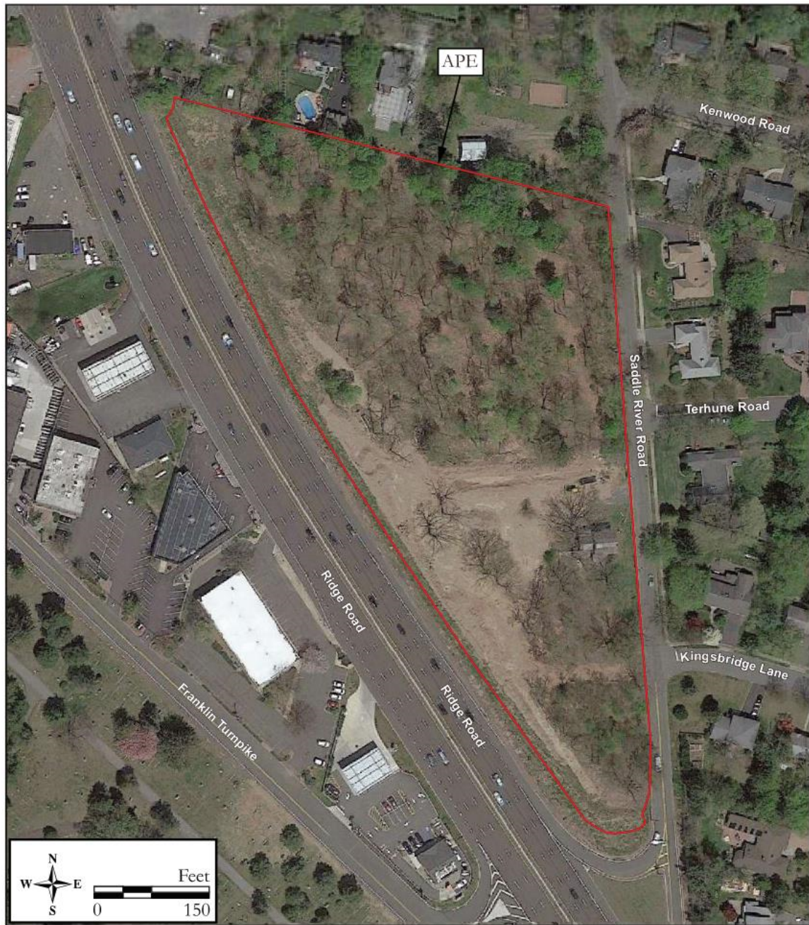
Figure 1.3: Aerial map of the APE (NJGIS, Digital Orthographic Imagery 2020).