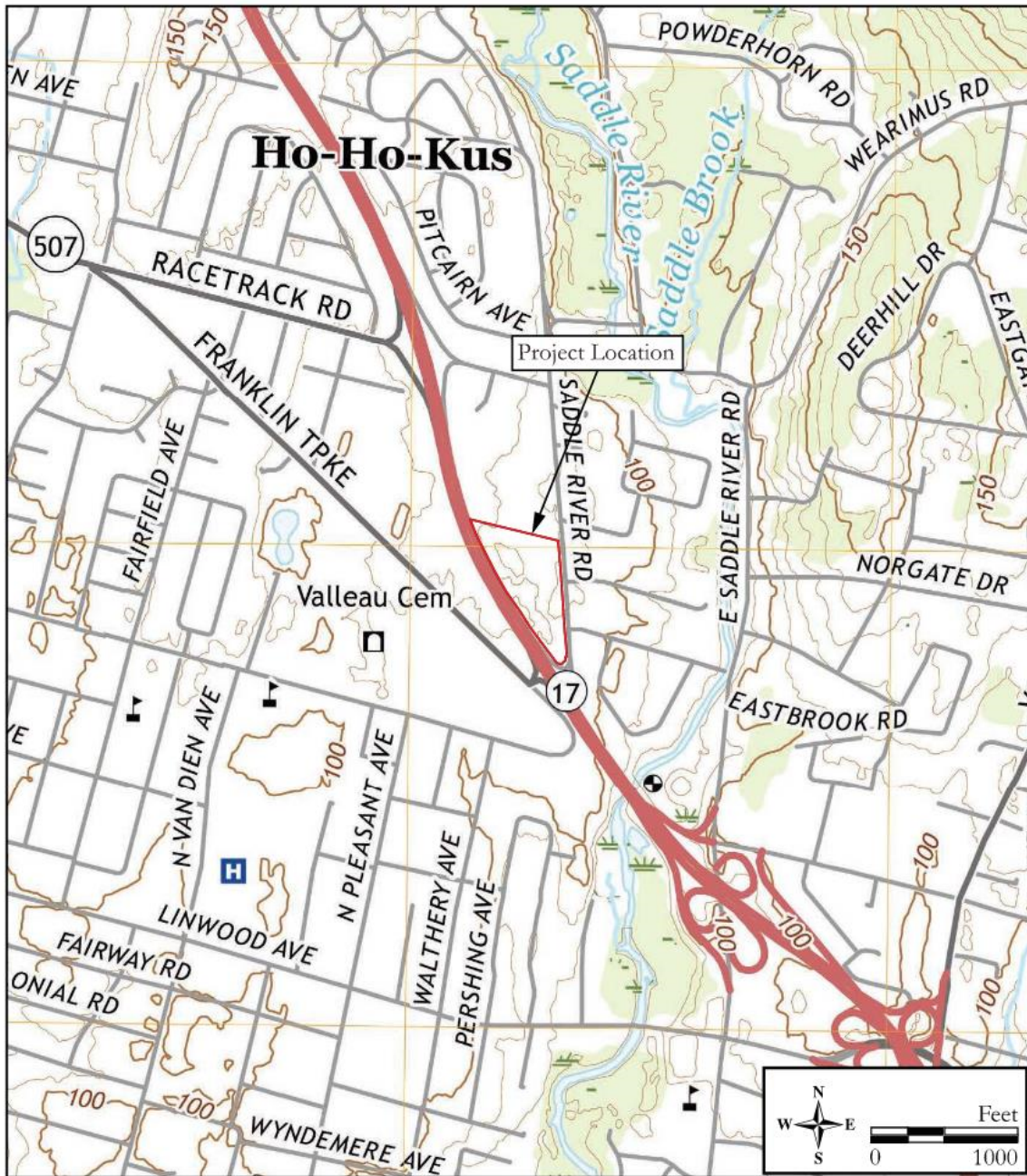
Figure 1.1: USGS map (1997 USGS 7.5' Quadrangle: Hackensack, NJ).