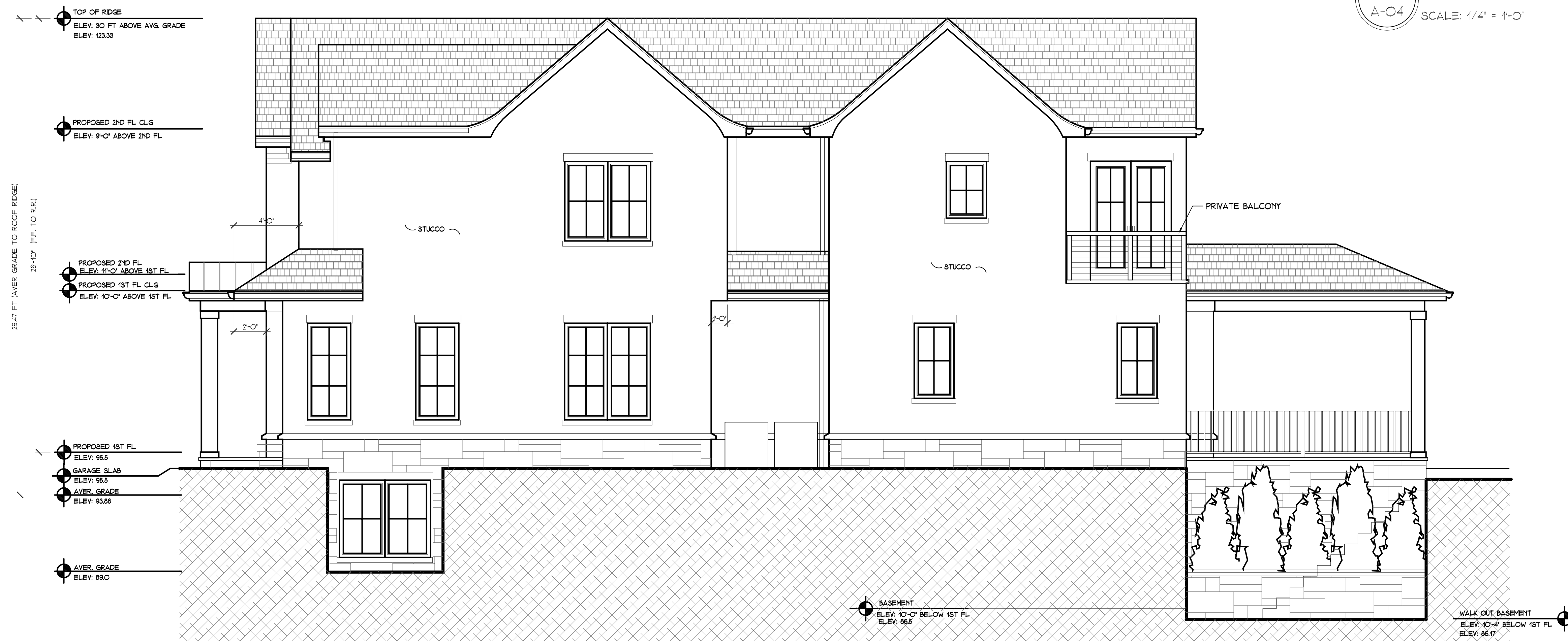
4 RIGHT SIDE ELEVATION SCALE: 1/4" = 1'-0"