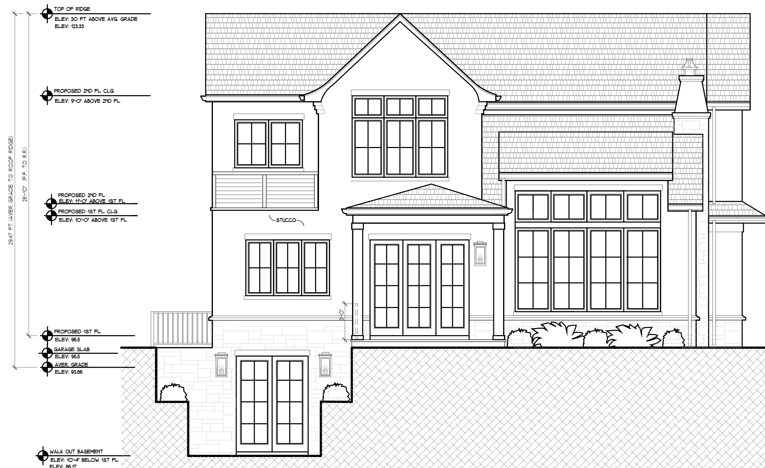
3 REAR ELEVATION SCALE: 1/4" = 1'-0"