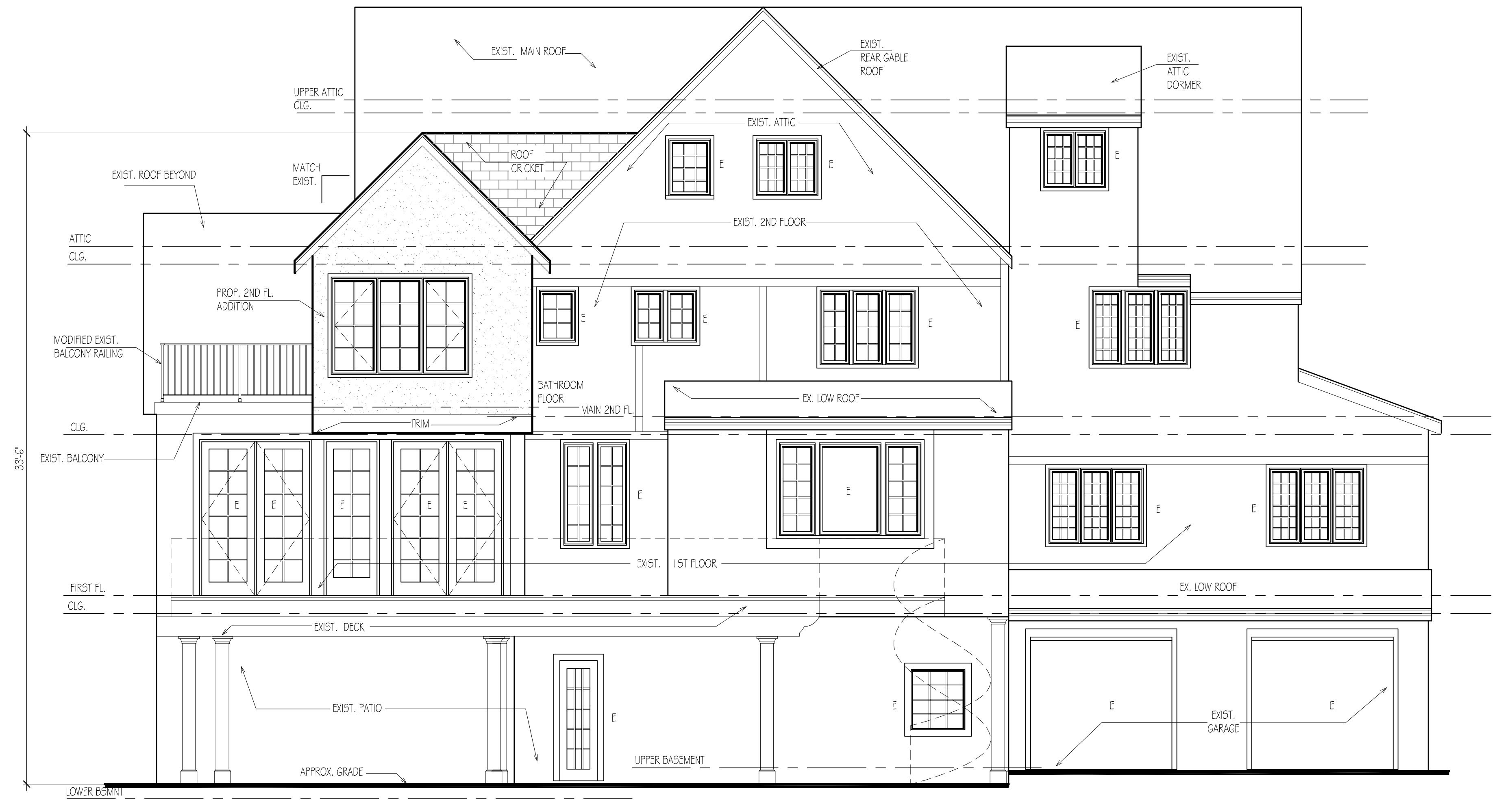
2 REAR ELEVATION SCALE: 1/4" = 1'-0"