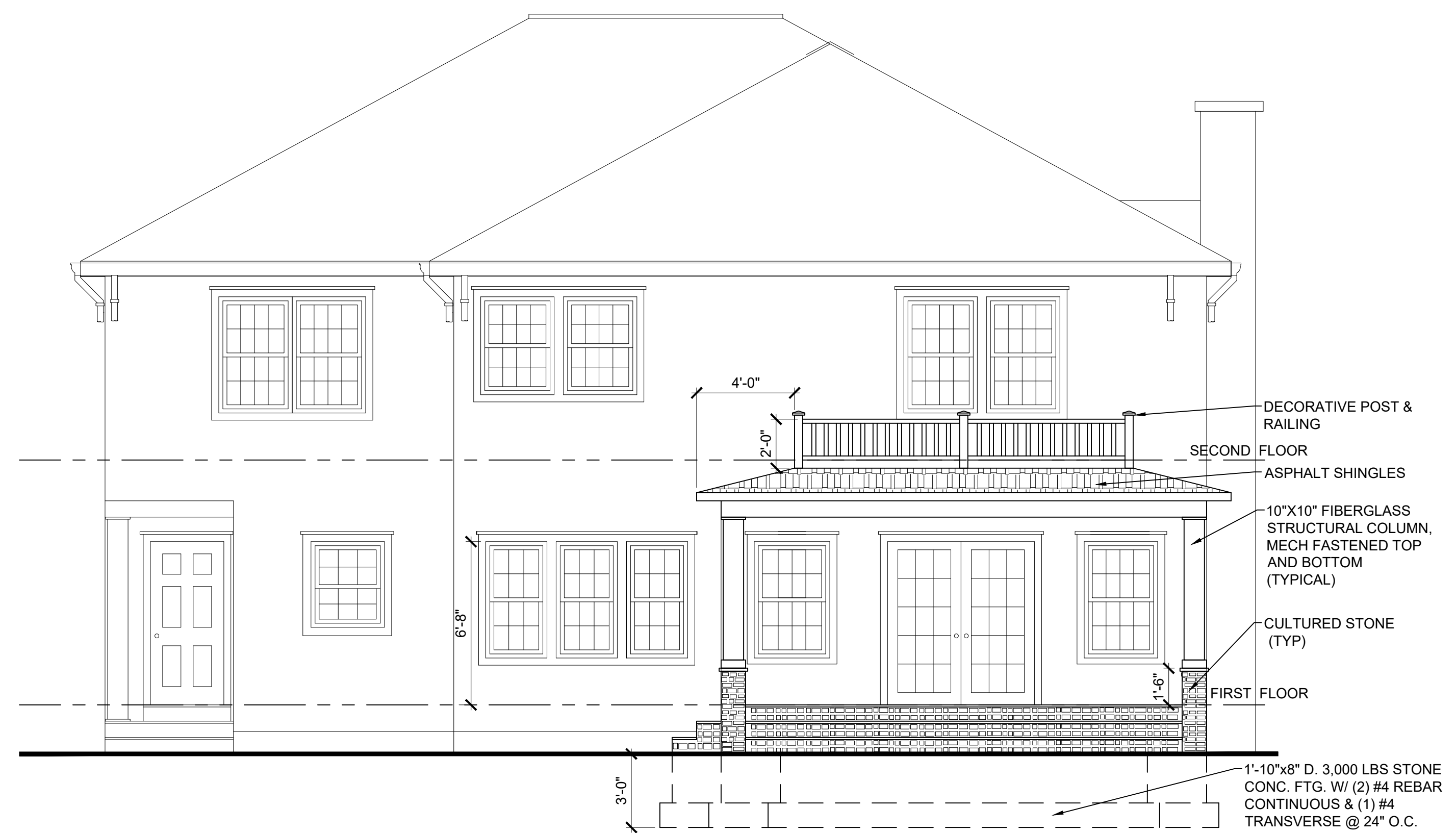
WEST ELEVATION SCALE: 1/4" = 1'-0"