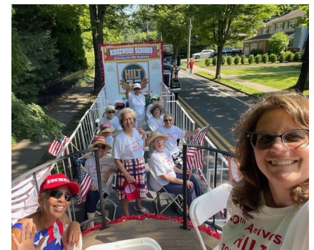
Ready to start the parade through town!