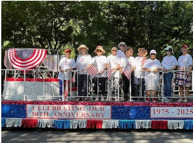
HILT Members 4th of July Parade - 2025