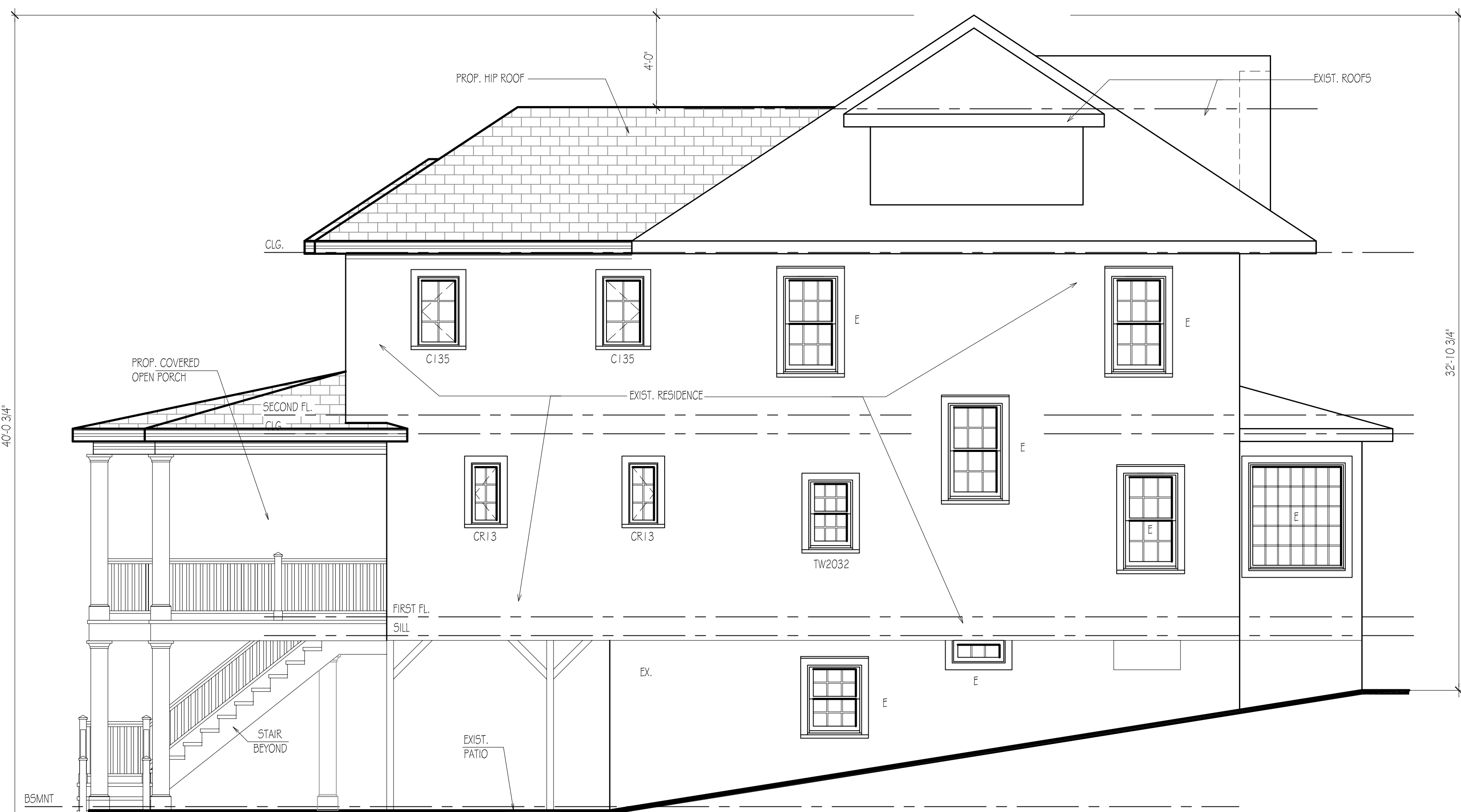
3 LEFT SIDE ELEVATION V-2 SCALE: 1/4" = 1'-0"