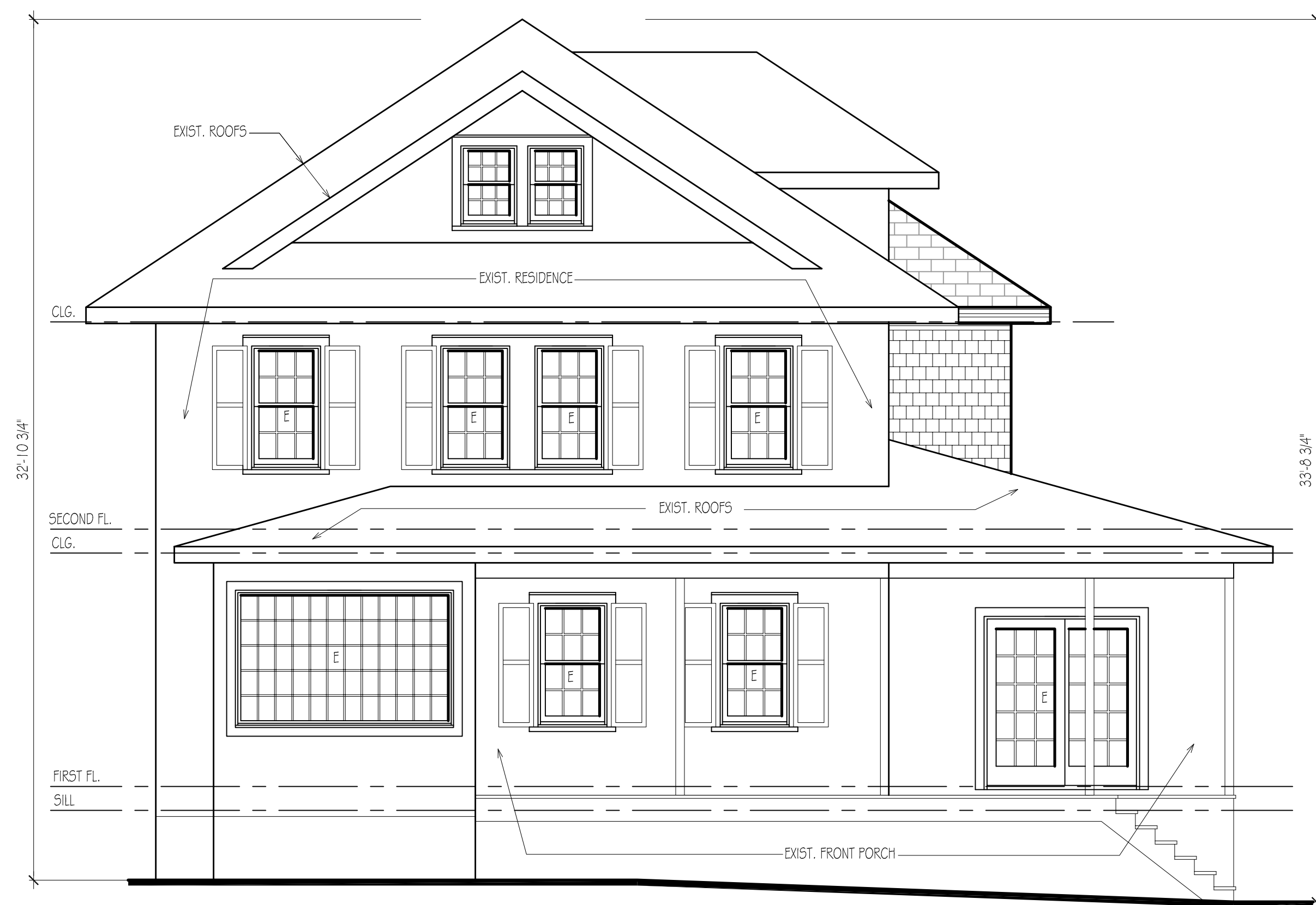
4 FRONT ELEVATION V-2 SCALE: 1/4" = 1'-0"

7-24-2025 ISSUED FOR VARIANCE 6-26-2025 ISSUED FOR OWNER'S REVIEW DATE ISSUE