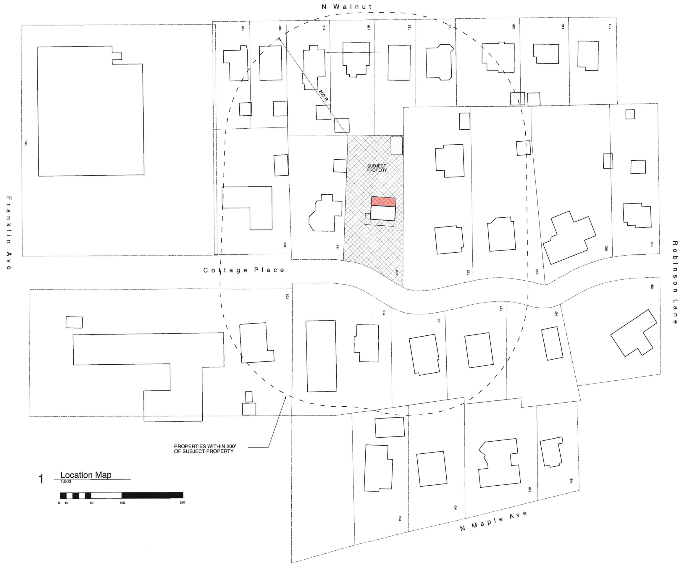
1 Location Map 1:500