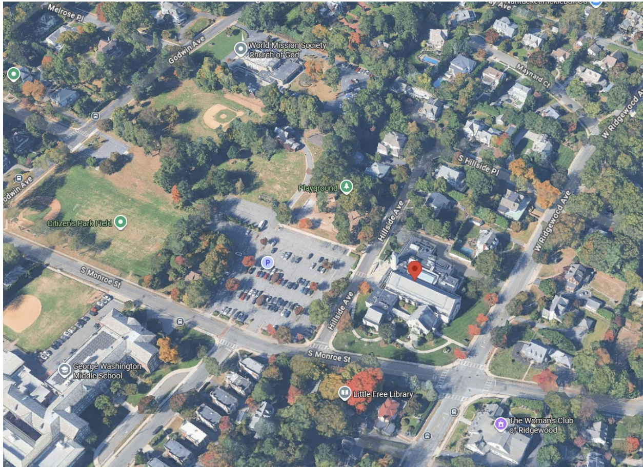
Google Aerial Image of Church and Associated Facilities