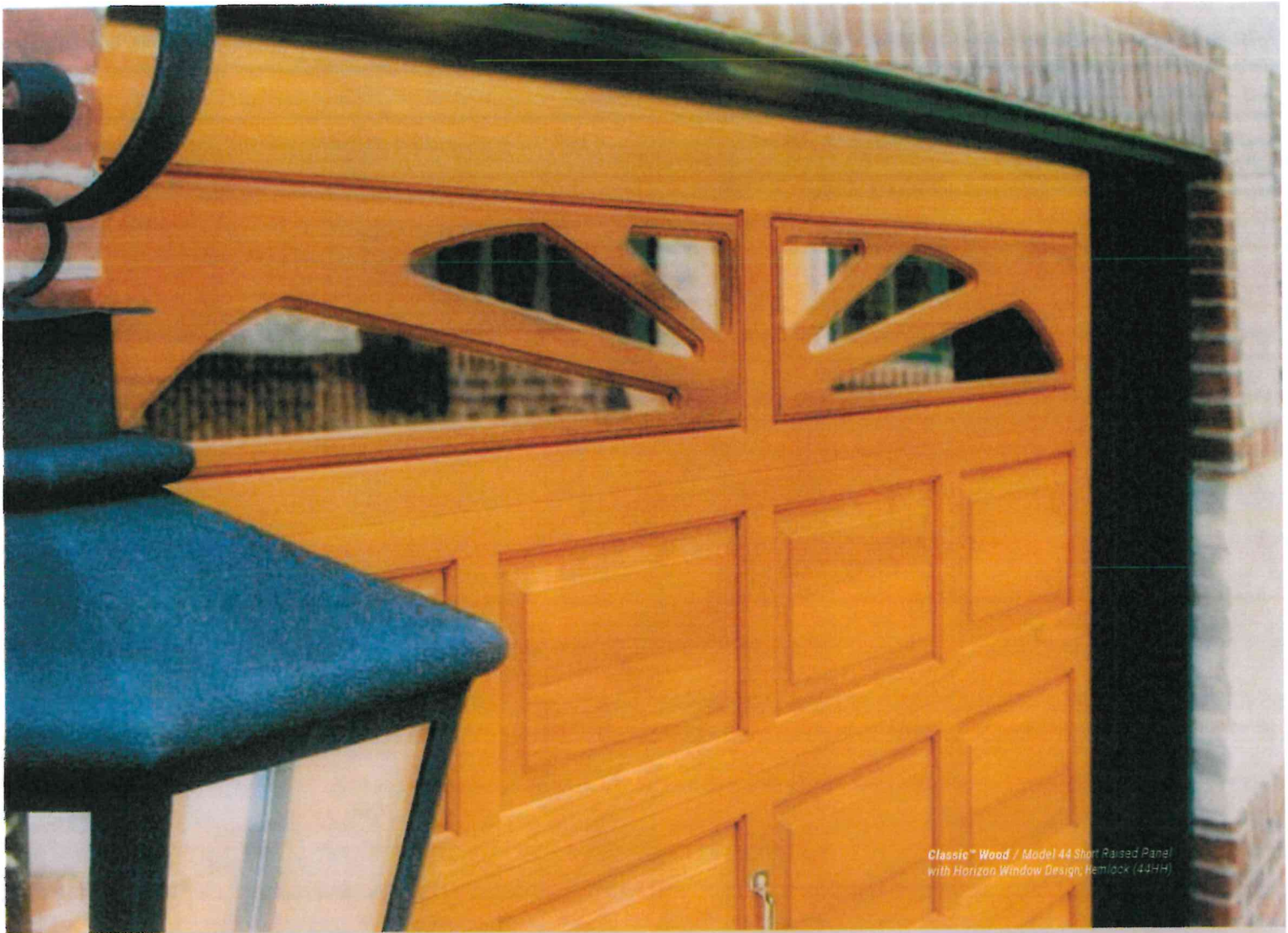
Classic™ Wood / Model 44 Short Raised Panel with Horizon Window Design, Hemlock (44HH)